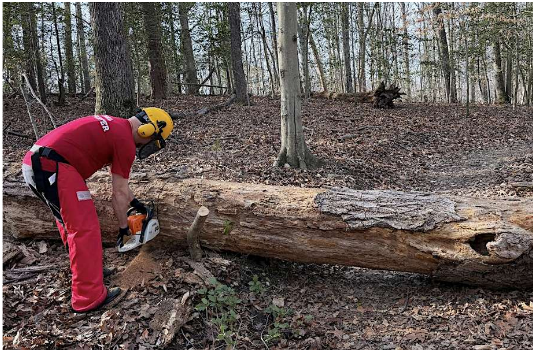
Mid-Atlantic Off-Road Enthusiasts maintaining trails at Locust Shade Park