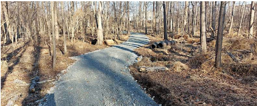
trail at the upper end of Catharpin Greenway next to Silver Lake Regional Park has been repaired

The cost analysis for “recreational trails” in Pathways 2035 produced an average cost per mile for all types of trails, based on recent construction projects. Costs range from $425,000/mile to $6,000,000/mile, depending upon the type of trail proposed. Specific cost per segment of planned trails will be developed at a later stage of planning.