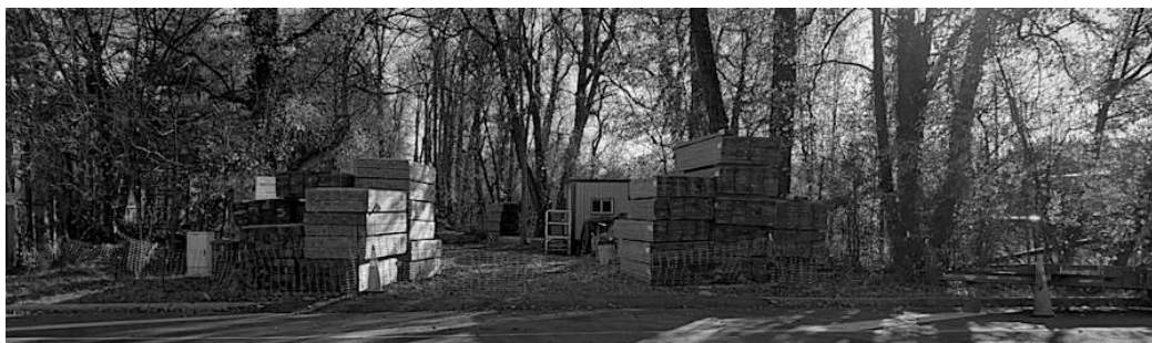
supplies for constructing the Featherstone segment of the Potomac Heritage National Scenic Trail