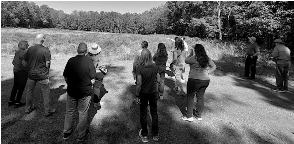
members of the Parks and Recreation Commission and Trails and Blueways Commission discussed future trails at Davis Ford Park on the September 13 bus tour

There's more to discover at the Rails to Trails Conservancy .