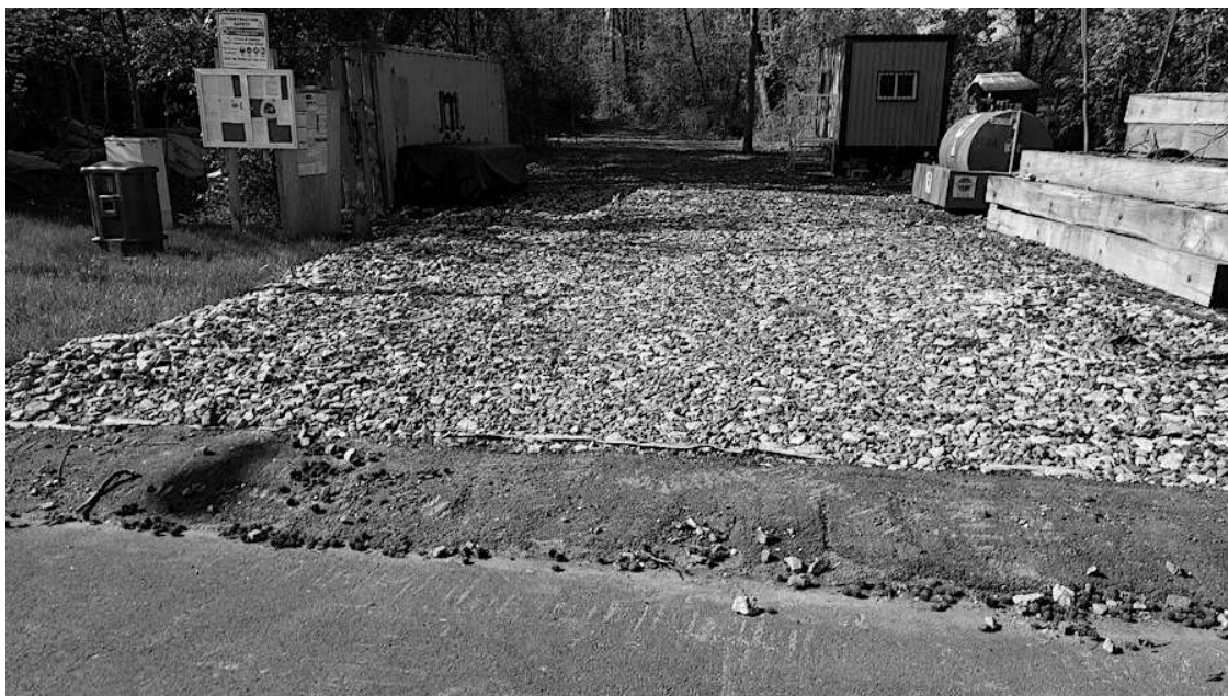
construction started on Potomac Heritage National Scenic Trail at Featherstone National Wildlife Refuge